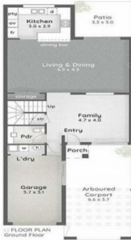
:: FLOOR PLAN Ground Floor