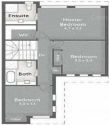
:: FLOOR PLAN First Floor